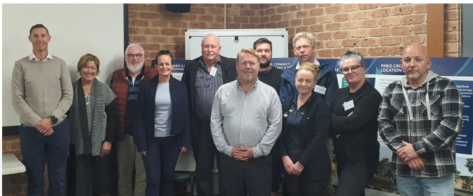
THE PARIS GROVE WORKFORCE ACCOMMODATION PRECINCT COMMUNITY REFERENCE GROUP

Albemarle is working hard to smooth the entry of Paris Grove into the Australind community and to ensure effective village management and oversight. The Paris Grove Community Reference Group (CRG) has been formed and is one of the ways we are talking with Australind residents about our plans and receiving feedback.