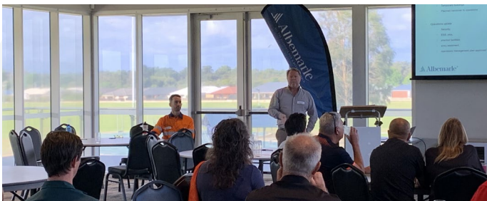
THE PARIS GROVE WORKFORCE ACCOMMODATION PRECINCT COMMUNITY REFERENCE GROUP

The Paris Grove Community Reference Group (CRG) was established earlier this year and has met a number of times, providing valuable feedback on operational management planning for the village.